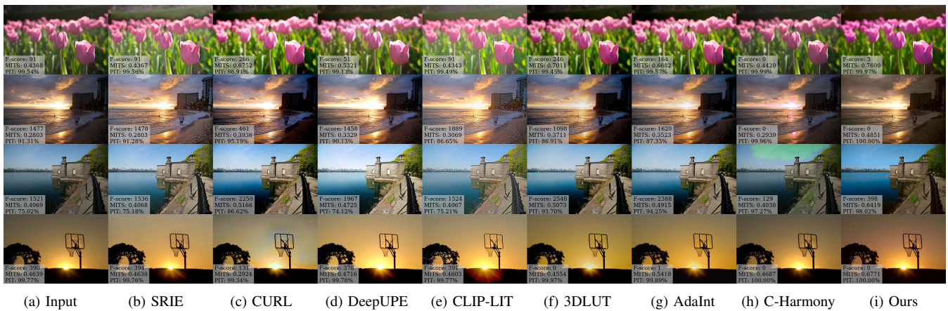
Fig. 3. Comparison of images against other methods on FiveK. Our method produces more saturated colors while preventing unnatural color shifts.